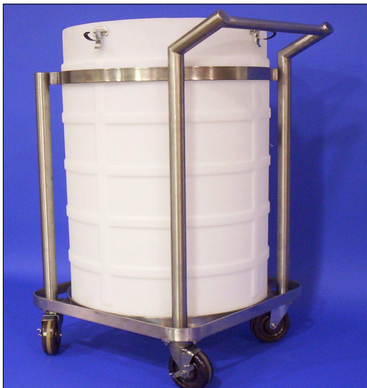
Model Number 001452